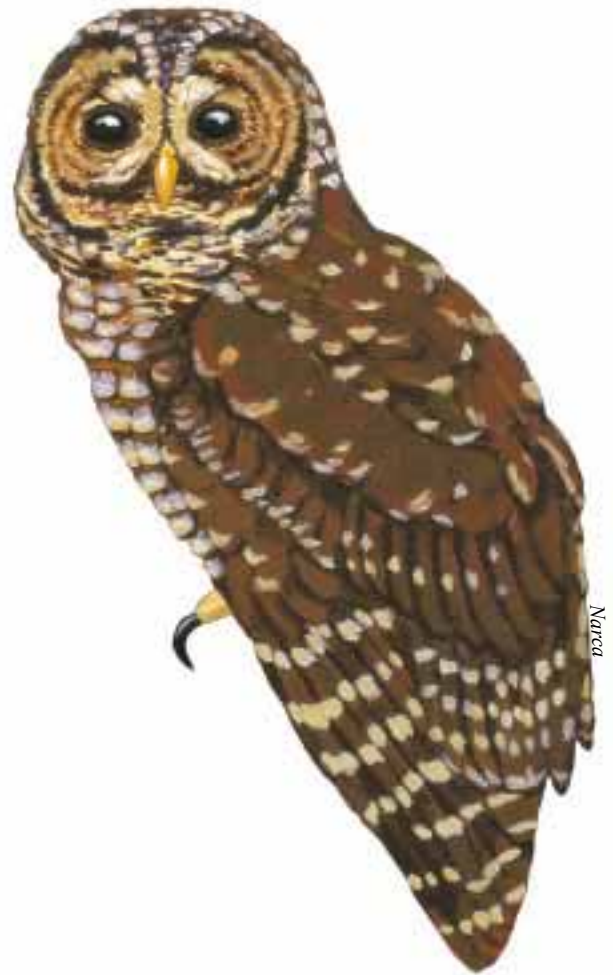
Mexican Spotted Owl